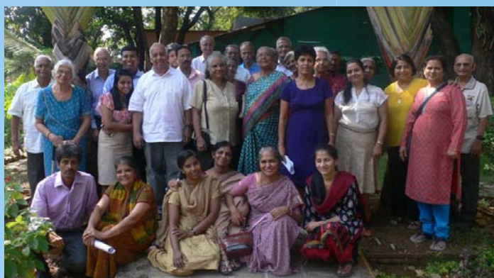
Consecrated women, couples group, youth and some friends of AMI in Mumbai.