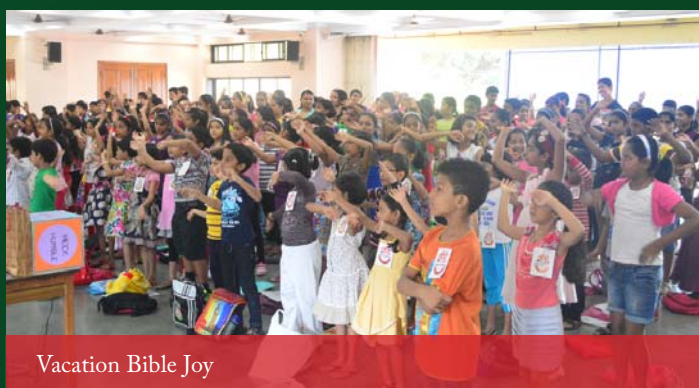
Vacation Bible Joy