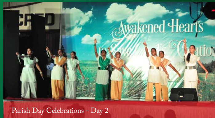
Parish Day Celebrations - Day 2