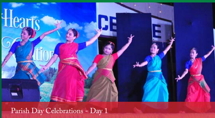
Parish Day Celebrations - Day 1