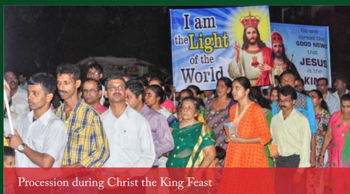
Procession during Christ the King Feast