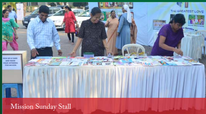
Mission Sunday Stall