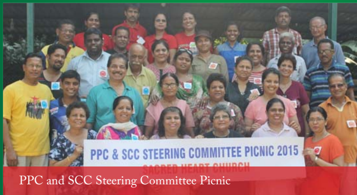
PPC and SCC Steering Committee Picnic