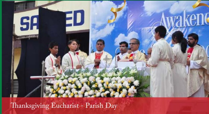
Thanksgiving Eucharist - Parish Day