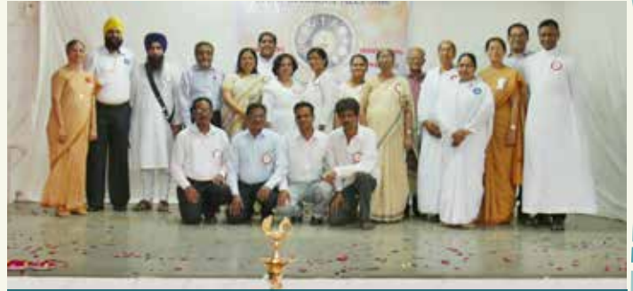
Inter Religious Meet