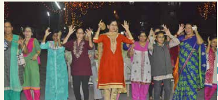
All Associations Day