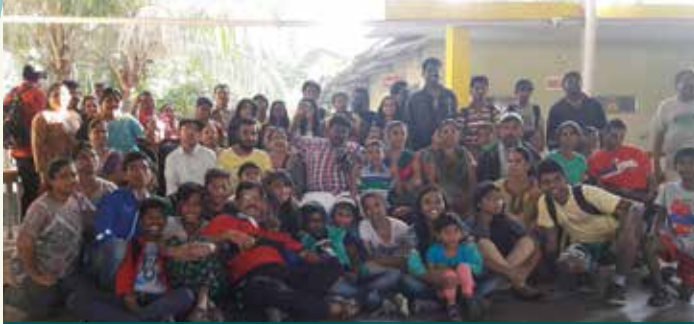
Community No. 1 - Picnic

Vibrant with the Spirit of the risen Lord, towards a community of deeper faith, worship, love and service