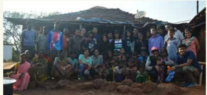
Youth Camp at Tala Mission