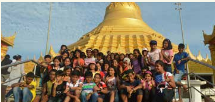
Altar Servers' Picnic