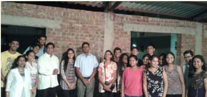
Youth Day - Community No. 11