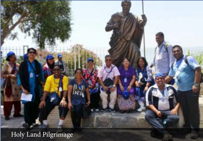
Holy Land Pilgrimage

Vibrant with the Spirit of the risen Lord, towards a community of deeper faith, worship, love and service