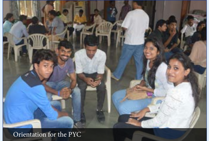
Orientation for the PYC