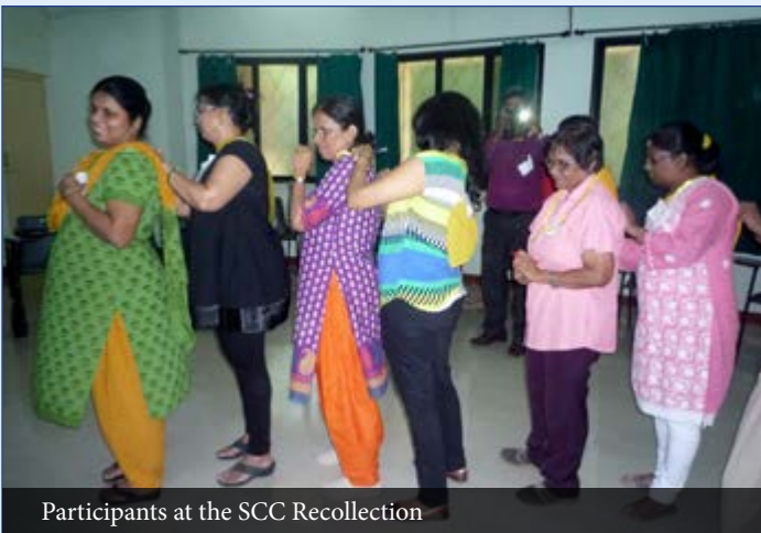
Participants at the SCC Recollection