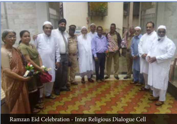
Ramzan Eid Celebration - Inter Religious Dialogue Cell