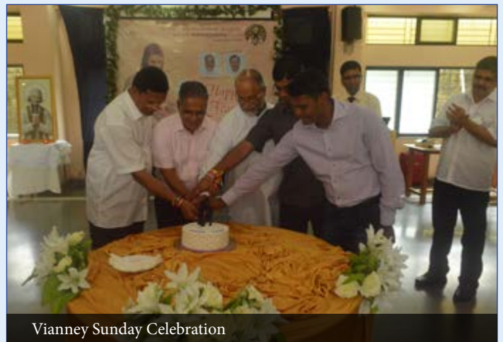
Vianney Sunday Celebration