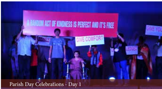
Parish Day Celebrations - Day 1