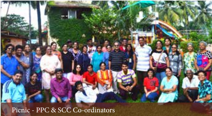
Picnic - PPC & SCC Co-ordinators

Vibrant with the Spirit of the risen Lord, towards a community of deeper faith, worship, love and service