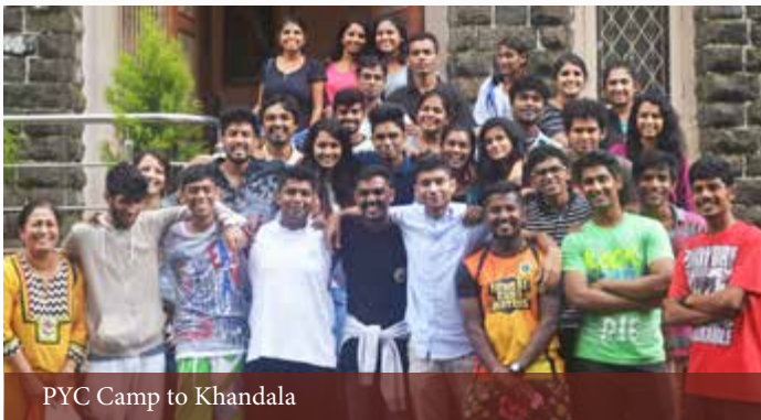
PYC Camp to Khandala