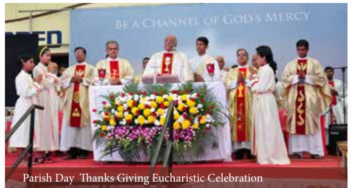
Parish Day Thanks Giving Eucharistic Celebration