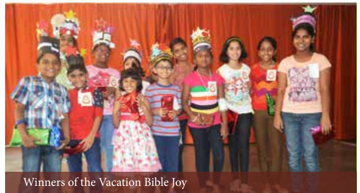
Winners of the Vacation Bible Joy