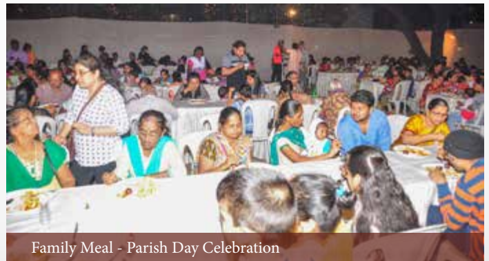
Family Meal - Parish Day Celebration