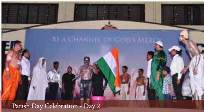
Parish Day Celebration - Day 2