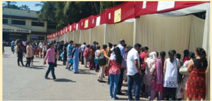
Family Day - Fun and Fair