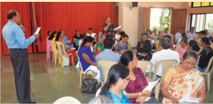
SCC Animators Training Session