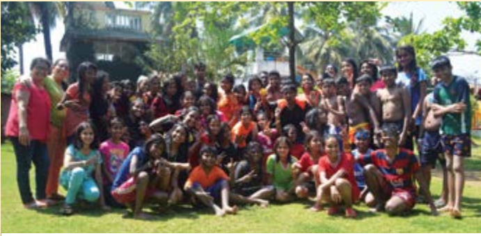
Altar Servers Picnic to Palm Beach Resort, Arnala

Vibrant with the Spirit of the risen Lord, towards a community of deeper faith, worship, love and service