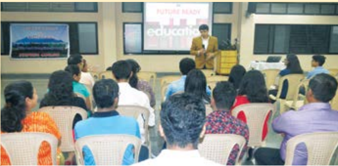
Dream Big 2