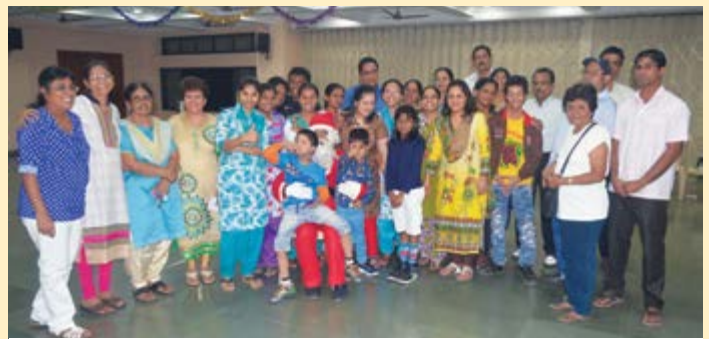
Special Childrens Christmas Party