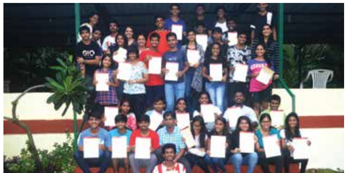
Leadership Camp cum Picnic