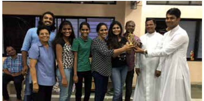
2nd Prize Winner of Collage Contest - Our Lady of Nazareth, Community No. 16