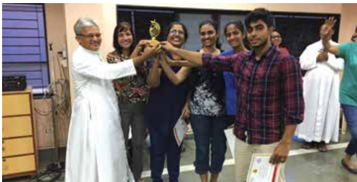
3rd Prize Winner of Collage Contest - Our Lady of the Rosary, Community No. 29