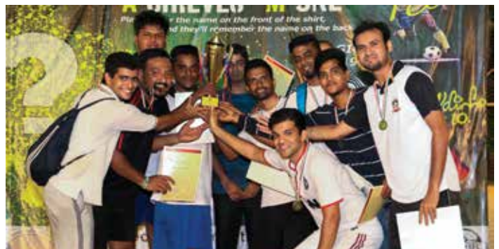
Holy Cross, Community No. 03 - Runners Up of Heart to Heart Liga - 2K17