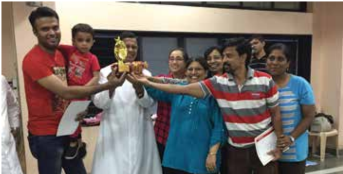
1st Prize Winners of Collage Contest - Good Shepherd, Community No. 07

Vibrant with the Spirit of the risen Lord, towards a community of deeper faith, worship, love and service