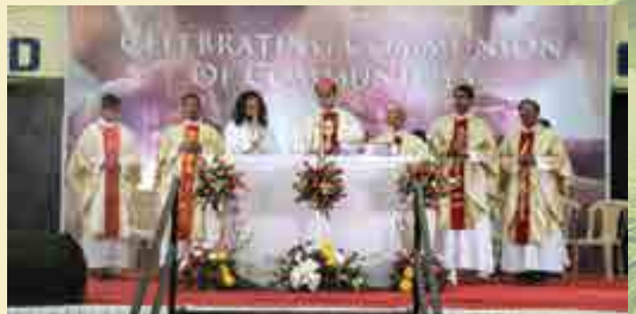
Parish Day - Thanksgiving Eucharistic Celebration