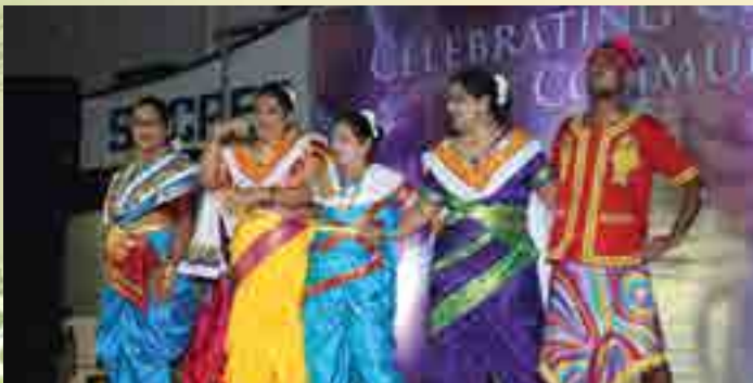
Parish Day Celebration - Day 2