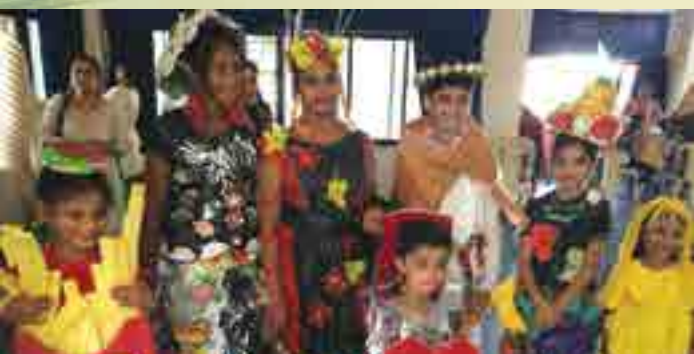
Best Out Of Waste Designer Wear Contest