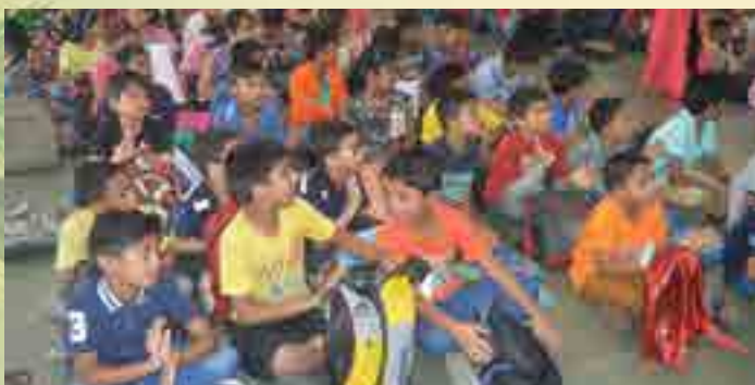
Vacation Bible Joy