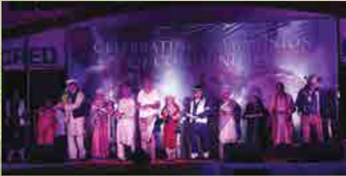
Parish Day Celebration - Day 1

Vibrant with the Spirit of the risen Lord, towards a community of deeper faith, worship, love and service