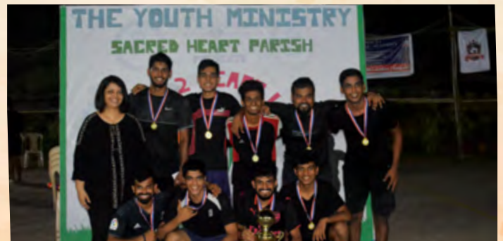
Shalom Community No. 30, Winners of Heart To Heart Liga 2K19