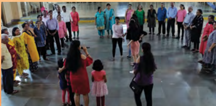
Parent's Day Celebration of St. Dominic Savio, Community No. 17