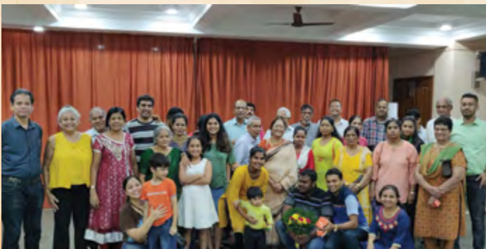
Annual Day of Divine Mercy, Community No. 9