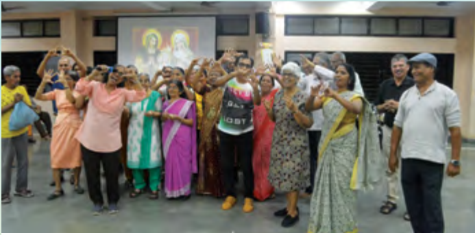
Grand Parents Day Celebration

Vibrant with the Spirit of the risen Lord, towards a community of deeper faith, worship, love and service