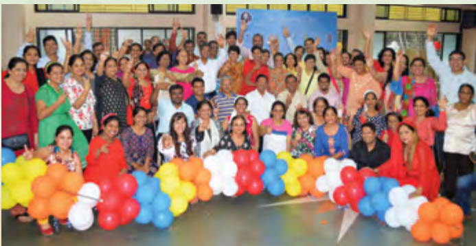
Vianney Sunday Celebration