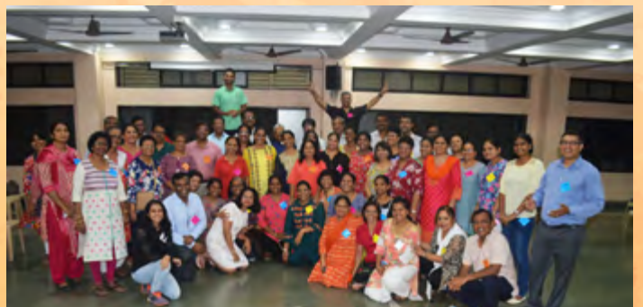
Get together of the Out Going PPC Members along with the New PPC Members