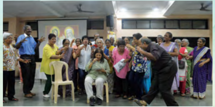
Grand Parents Day Celebration