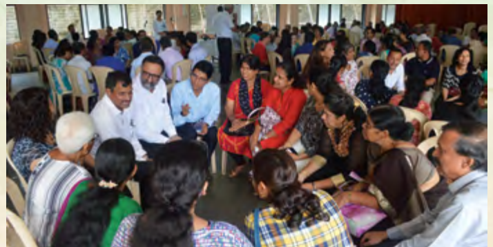
Partipants at the 'Leadership in the Christian Spirit' Workshop