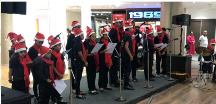
Sacred Heart Junior Choral Ensemble at the Phoenix Mall