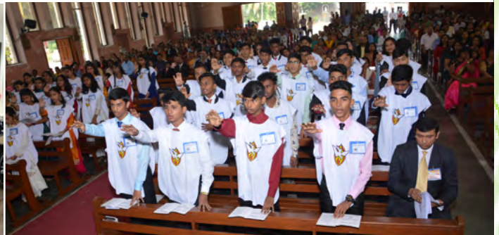
Confirmands Renewing The Baptismal Promises