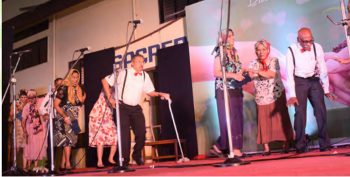
Silver Jubilee of Senior Citizen Cell