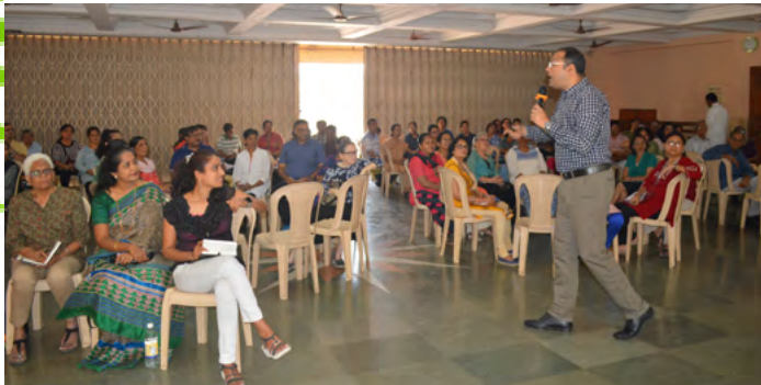
Animators Training Workshop