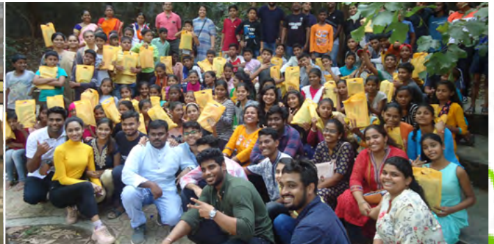
Community Social Responsibility