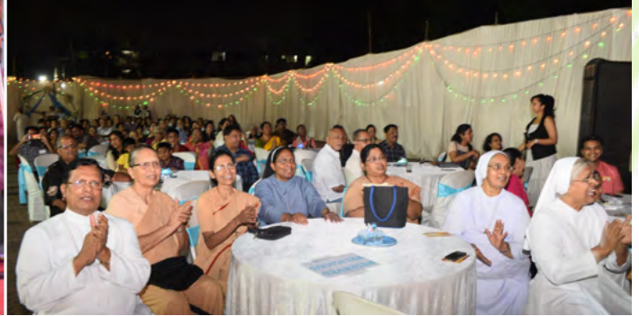
Silver Jubilee of Senior Citizen Cell