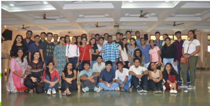
Public Speaking Workshop