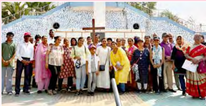
Community No. 08 - Pilgrimage to Our Lady of Vailankanni Shrine