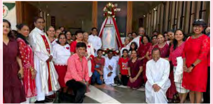
Divine Mercy Sunday