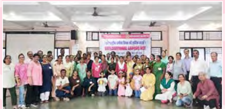
Labour Day celebrations by Inter-Religious Dialogue Cell