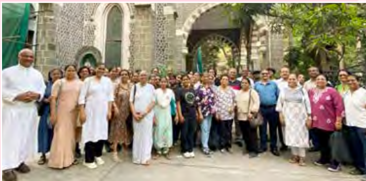
Community No.16 - Stations of the Cross at 14 Churches