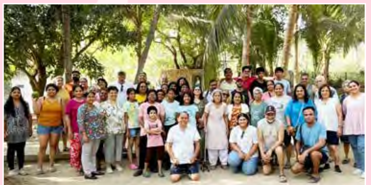
Community No 10, 33 & 34 Picnic to Boscowadi Uttan