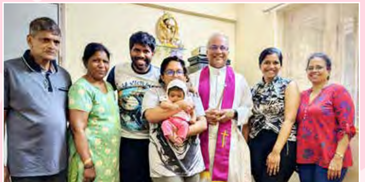
Community No.13 - House Blessing