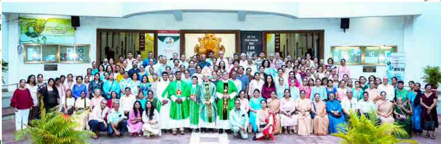
Felicitation of SCC Project Team Members - Parish SCC Day